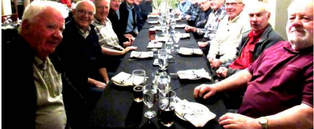
The Romeos (Retired Old Men Eating Out) enjoyed food and fellowship at the Mill.