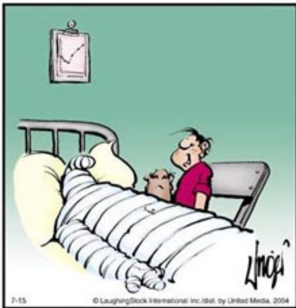
“I've seen it all before. He's changing into a butterfly.”

PROBUS Club of Northumberland PO Box 491, Cobourg, Ontario, K9A 4L1