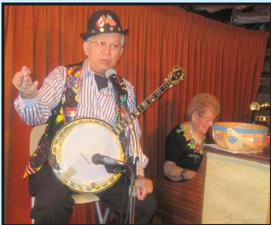
Herongate's Lunchtime Entertainers